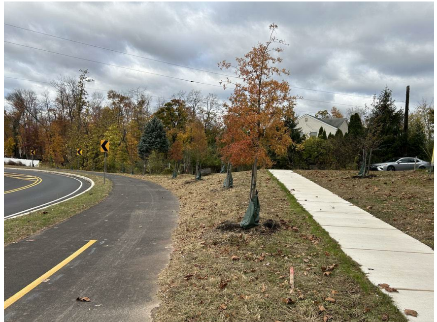
MC #45 – Spring Ave & Commerce Drive & MC #54 Commerce Drive & Virginia Ave

The following pages include the updated Missing Connections List. For a visual reference, the corresponding map can be accessed online at www.bit.ly/udtospmap